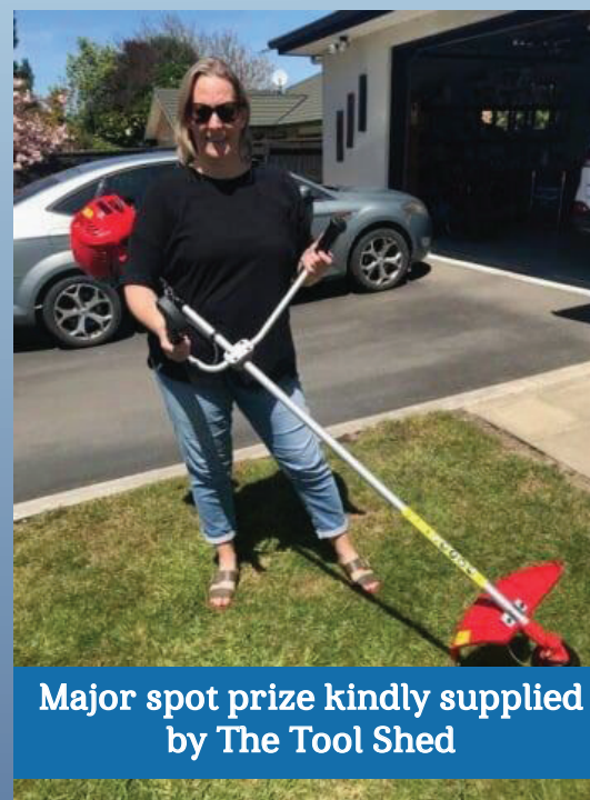
Major spot prize kindly supplied by The Tool Shed